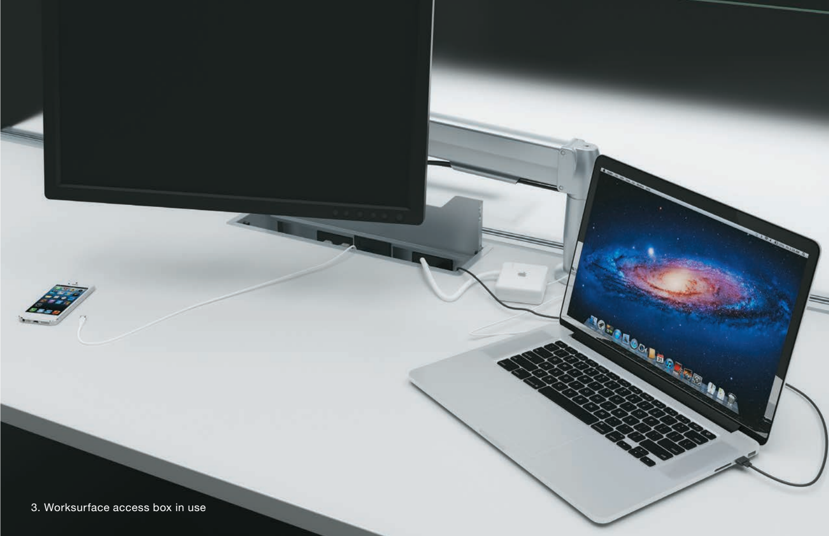
3. Worksurface access box in use